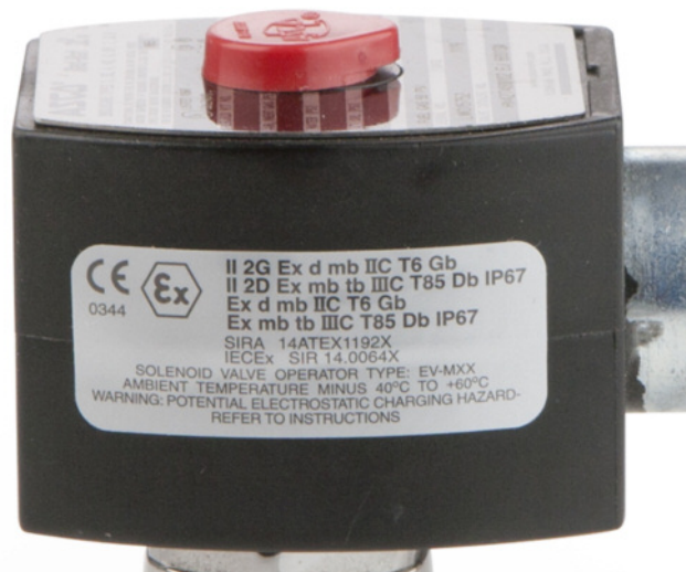
Figure 1: labels may have multiple T-codes to cover every real-world contingency.

If conditions at the facility where the valve will be used might qualify as this kind of special circumstance, consult the valve manufacturer before specifying a final purchase.